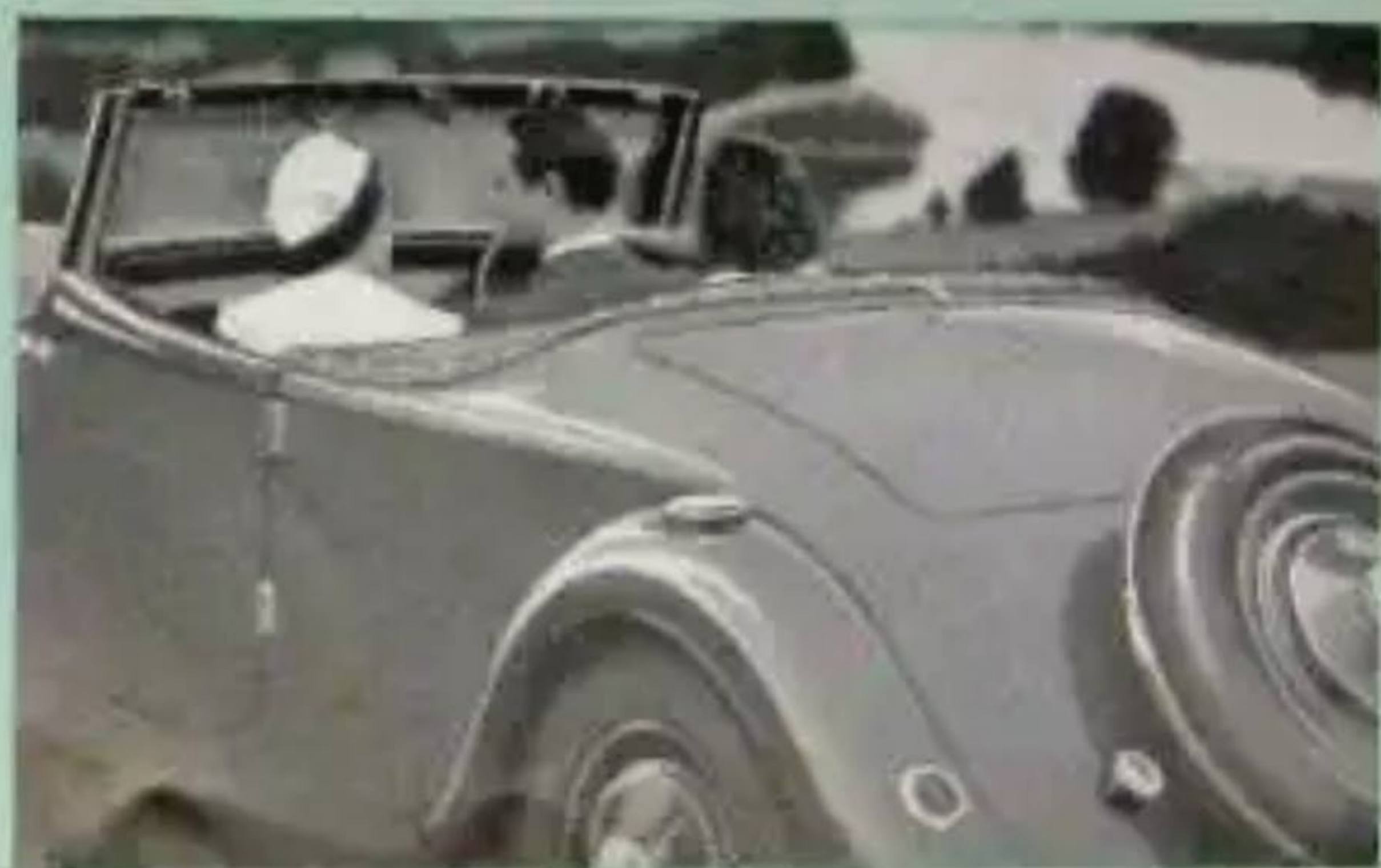
Shapely lines, wide front seat, double dicky.