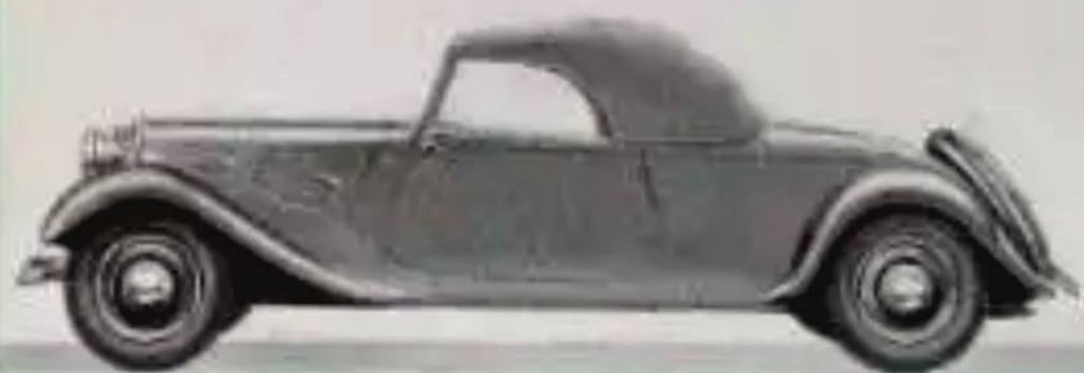
ROADSTER, showing hood up. A perfect all-weather car.