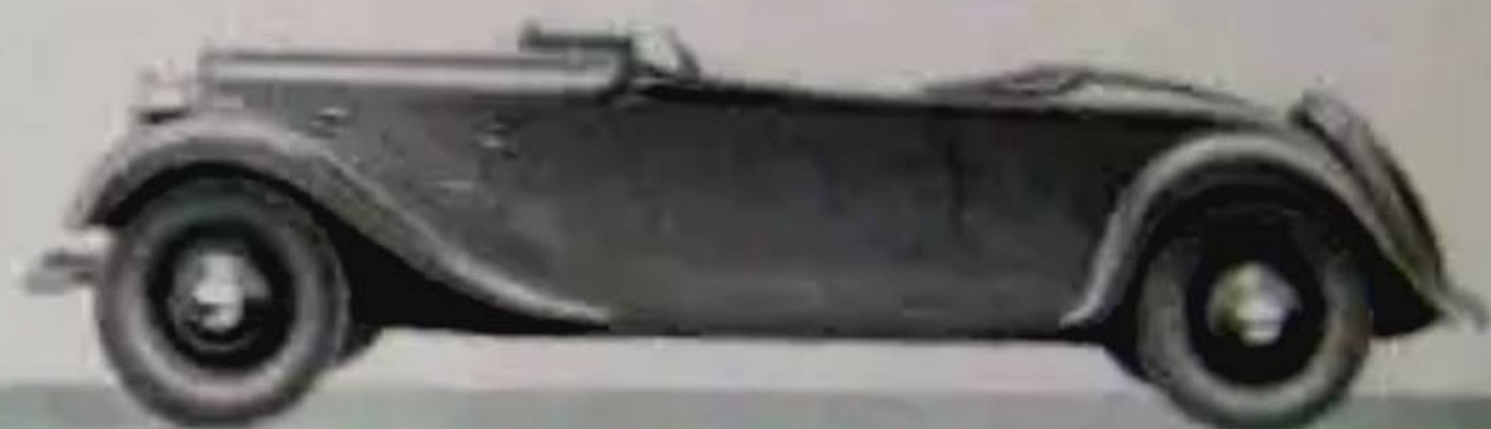
ROADSTER, with hood and screen folded. The hood is concealed when down.